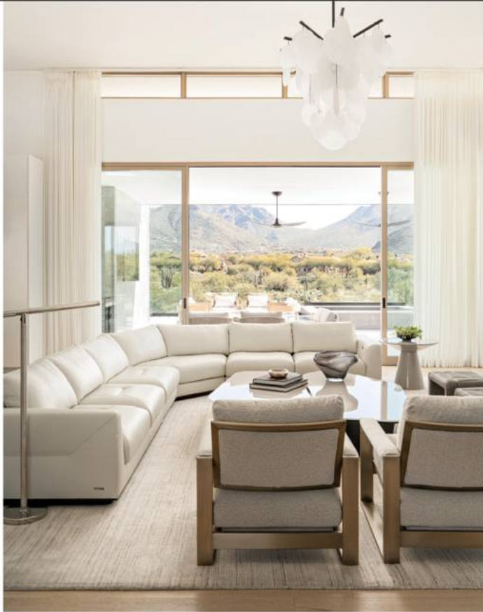
Framed by clerestory windows, expansive glass pocket doors and window walls in nearly every room, a sweeping tableau of mountain vistas is visible from virtually every vantage point on the property. In the living area of the great room, seating is arranged to host plenty of guests, take in the warmth of the fireplace on cool evenings and have a front-row seat to the views.