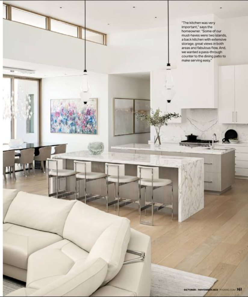
"The kitchen was very important," says the homeowner. "Some of our must-haves were two islands, a back kitchen with extensive storage, great views in both areas and fabulous flow. And, we wanted a pass-through counter to the dining patio to make serving easy."