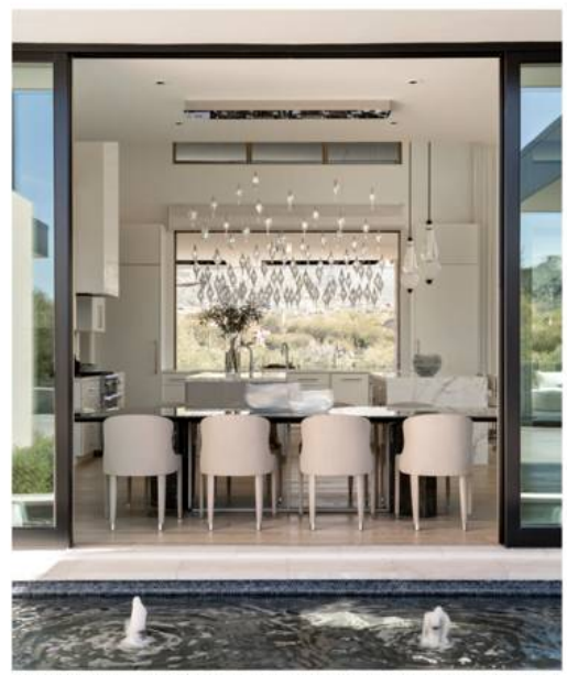
Sliding pocket doors open the dining area to a burbling water feature that not only provides guests with pleasant background noise, but also helps filter out the sound of passing cars nearby. "We wanted the interior to flow beautifully, feel open and uncluttered, and be light and bright," says the homeowner. "And water features were a must-have for their soothing and beautiful qualities."