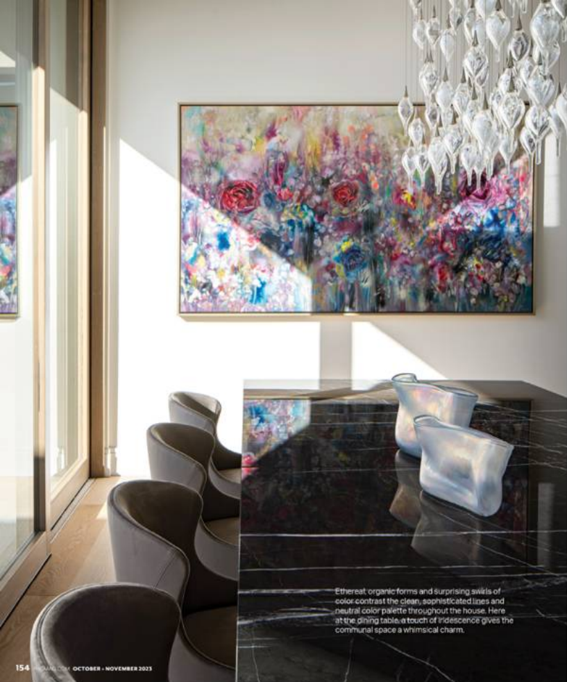
Ethereal organic forms and surprising swirls of color contrast the clean, sophisticated lines and neutral color palette throughout the house. Here at the dining table, a touch of indescence gives the communal space a whimsical charm.

BY CARLY SCHOLL