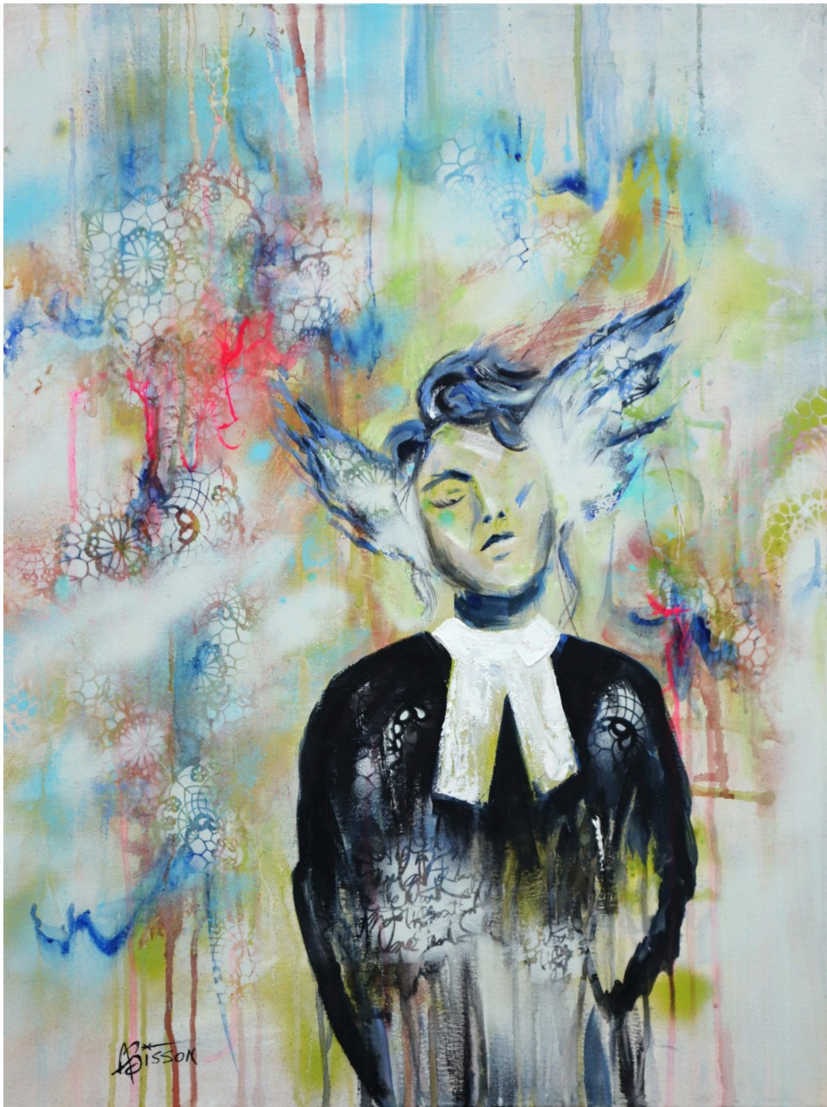
Wings of justice VIII

Whatever your role in the Justice system, your work matters.