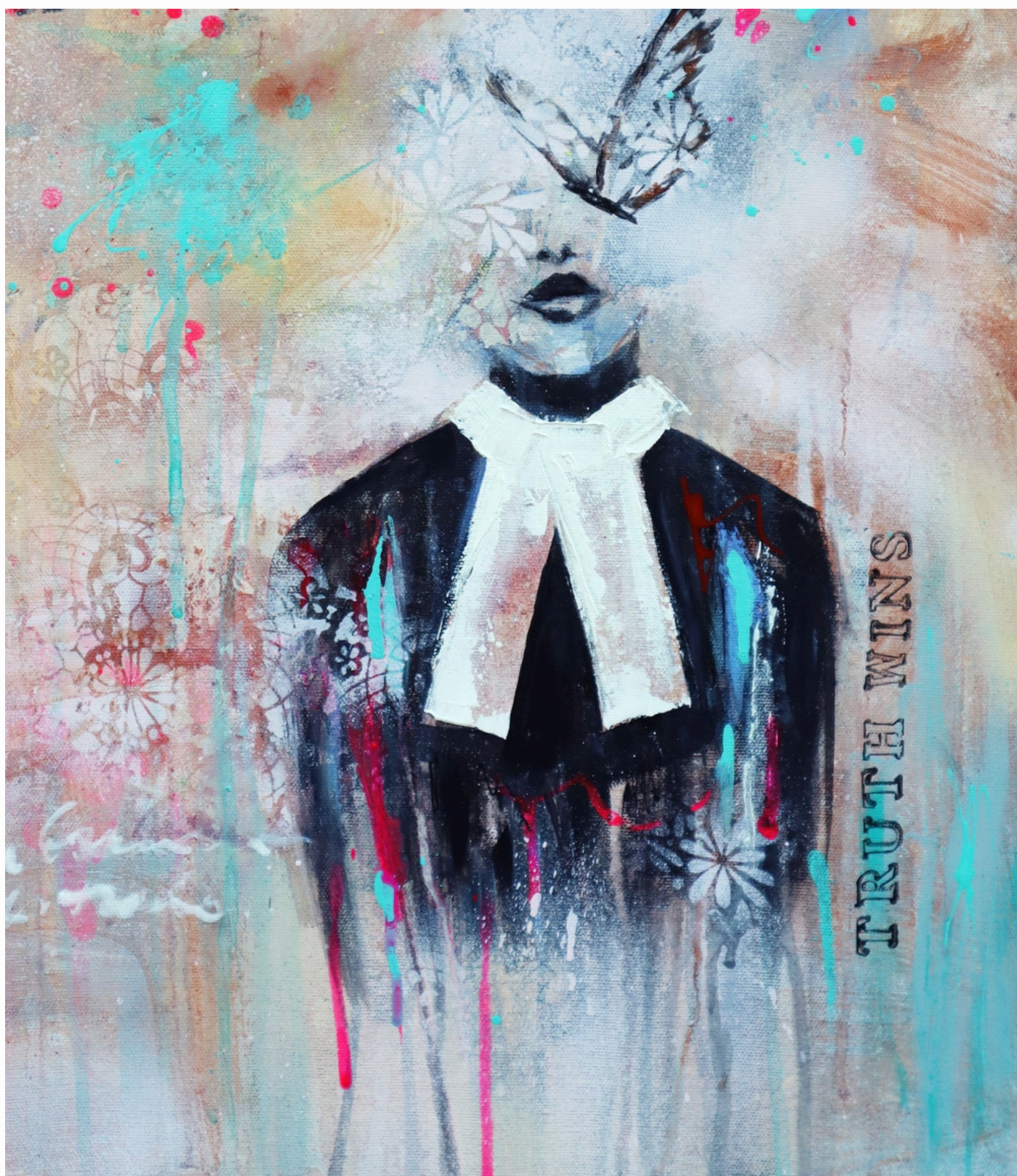
Wings of justice III