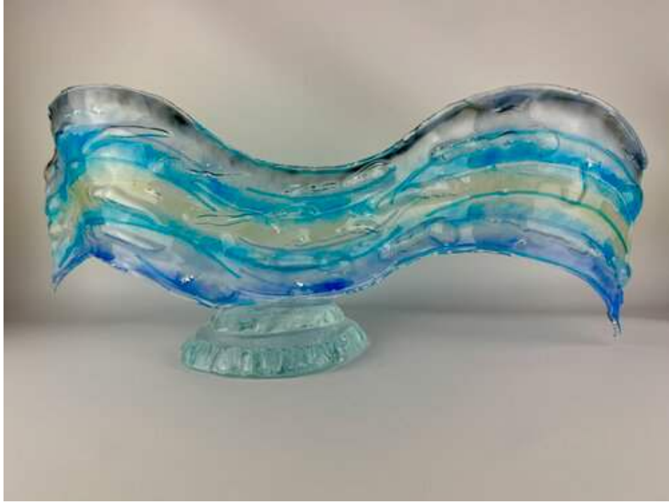
"Wind" fused glass, 24" x 5" x 10"