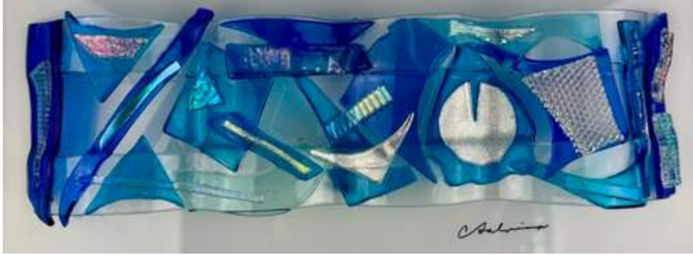
"Dawn's Light" fused glass, 11" x 18"

Growing up in a bustling city, I always had an appreciation for art. But it wasn't until I took a stained glass class in college that I truly felt a spark. There was something about working with glass—its fragility, and its potential for beauty—that captivated me.