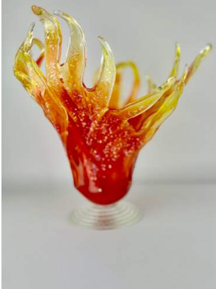
"Fire" fused glass, 10" x 10" x 12"