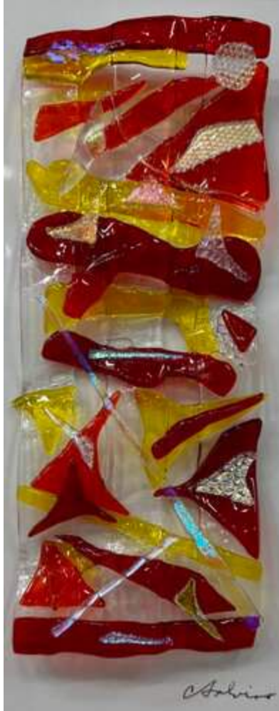
"Red Ripples" fused glass, 11" x 18"

When I retired from medicine, I knew that it was finally time to dedicate myself fully to glass art. It felt like the perfect time to give this lifelong passion the attention it deserved. I built a studio in my home, where I could create glass sculptures, bowls, and intricate designs, exploring the medium in new ways.