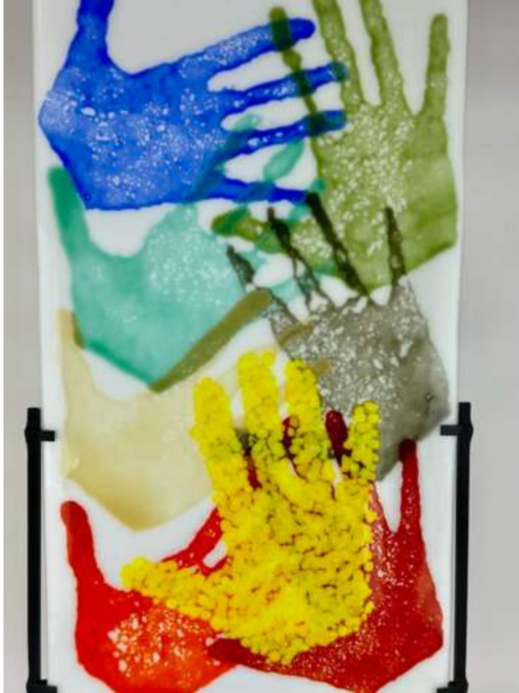
"Together" fused glass, 10" x 18"

Later I switched to fused glass. I dabbled with it during the limited free time I had between seeing patients and managing my family. I'd sneak into the studio whenever I could, using those precious moments to explore the art form. I created small glass panels that became a personal escape from the fast-paced, high-stakes world of medicine.