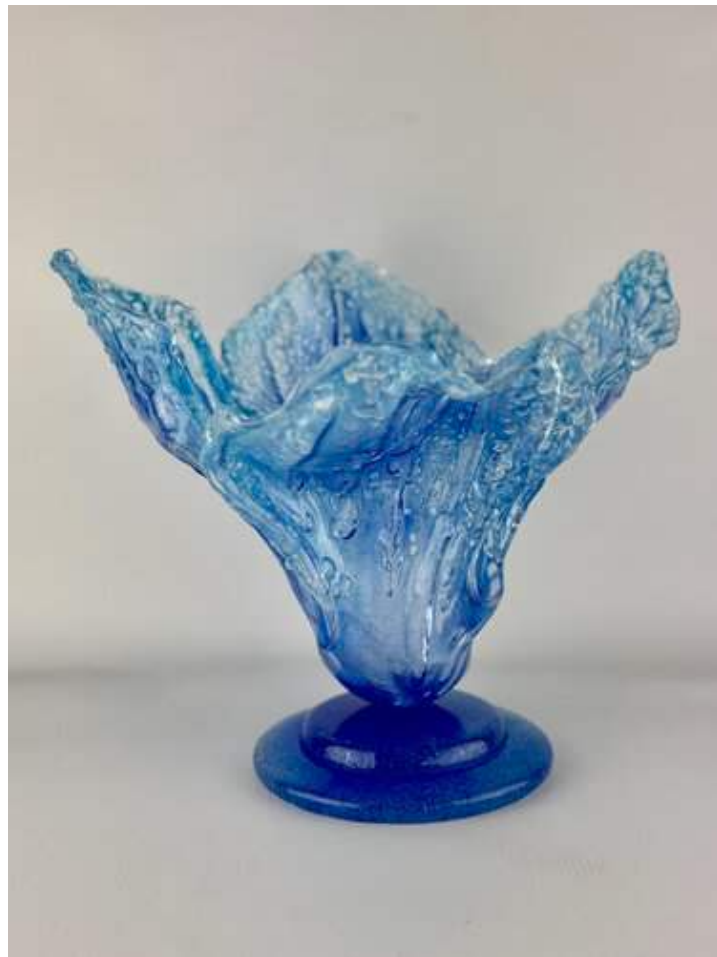
"Ocean's Whisper" fused glass, 16" x 16" x 12"