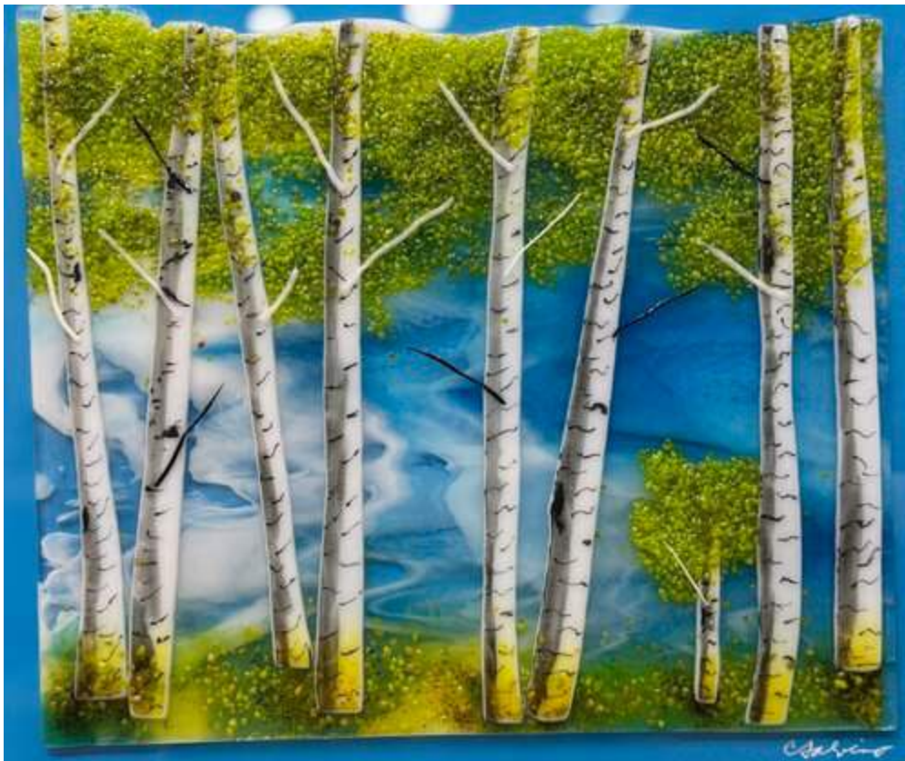
"In The Aspen Grove" fused glass, 14" x 20"

Growing up in a bustling city, I always had an appreciation for art. But it wasn't until I took a stained glass class in college that I truly felt a spark. There was something about working with glass—its fragility, and its potential for beauty—that captivated me.