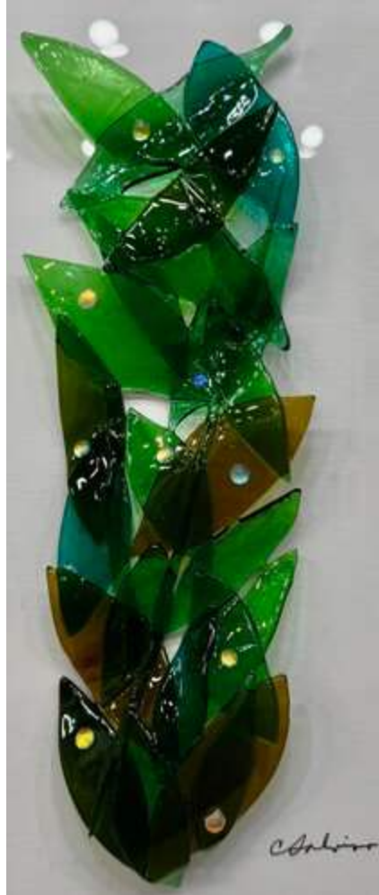
"Ripple of Leaves " fused glass, 11" x 18"

Now, as I embrace this new chapter of my life, I'm excited to share my work with others, knowing that it took a lifetime of experience to bring me to this point. From the delivery room to the glass studio, I've learned that life is about growth, reinvention, and the courage to follow your passions—no matter where they take you.