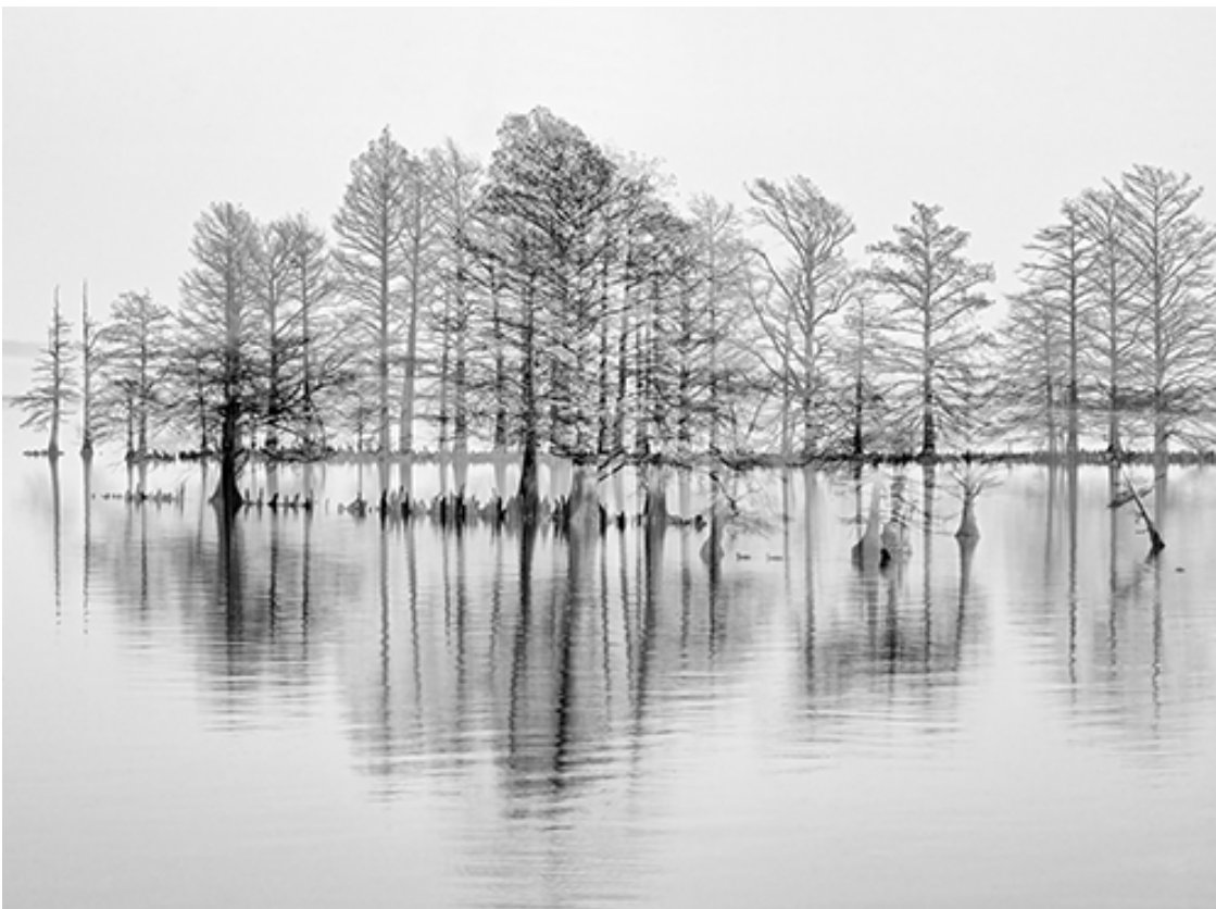
"Cypress Dreams" photography, various sizes

Sheryl's Virtual Garden began as a business based on a chance encounter. A neighbor saw some of the floral images I shot in the neighborhood. She suggested I turn them into notecards, and Sheryl's Virtual Garden was born.