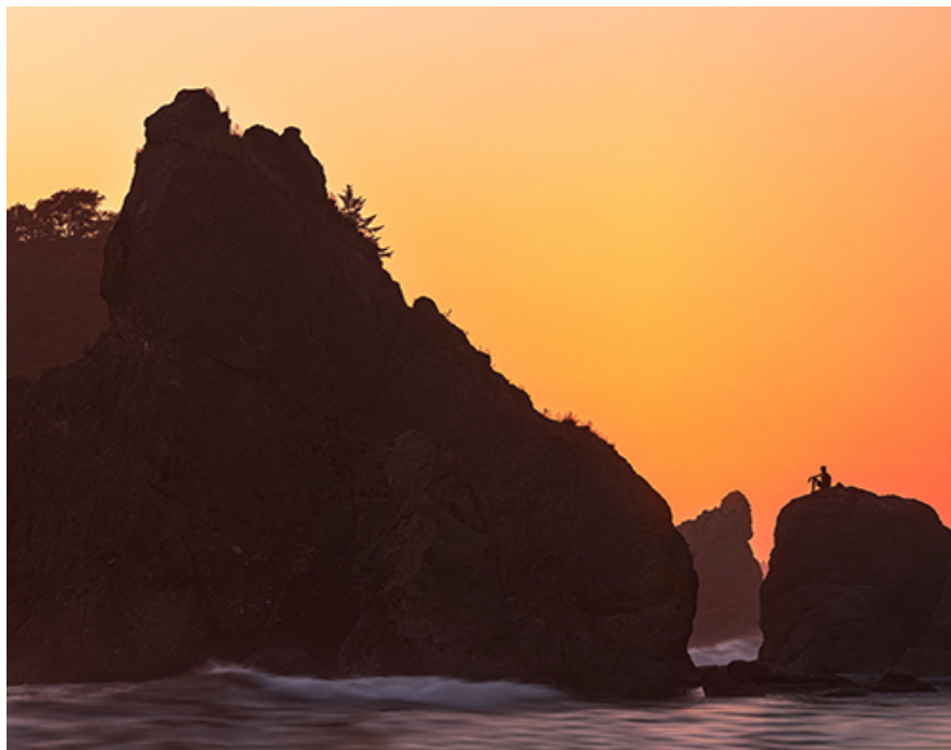
"Sunset Thinker at Ruby Beach" photography, various sizes

I love photographing out in nature and sharing the emotions I feel through my photography and digital artistry skills. My followers and art buyers enjoy living vicariously through my camera lens. My initial focus was on florals shot with a shallow depth of field to create a dreamy blur. I also began to explore landscape photography through workshops and independent travel experiences.