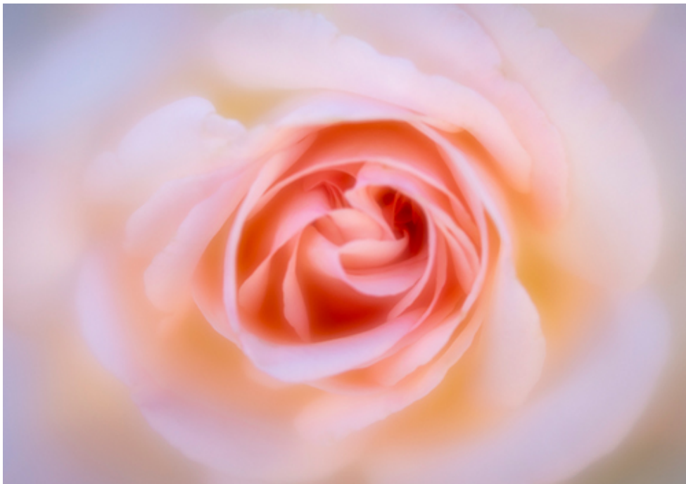
“Blushing Rose” photography, various sizes

I began to actually learn photography following a career-ending medical emergency. My occupational therapist recommended that I write, so I started a blog. Of course, every blog must have photos, so I bought my first DSLR camera.