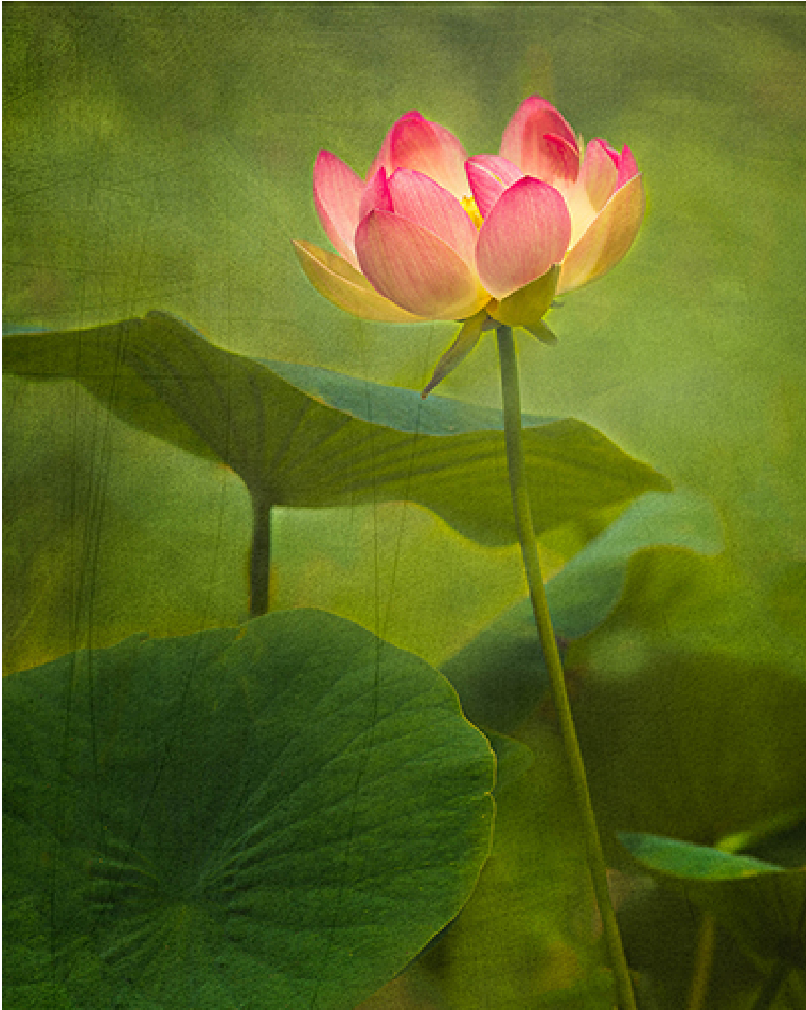
"And Still I Rise" photography, various sizes

Photographer Sheryl Ball shares an artistic view of our natural environment through her virtual garden. See more of her work on her website .