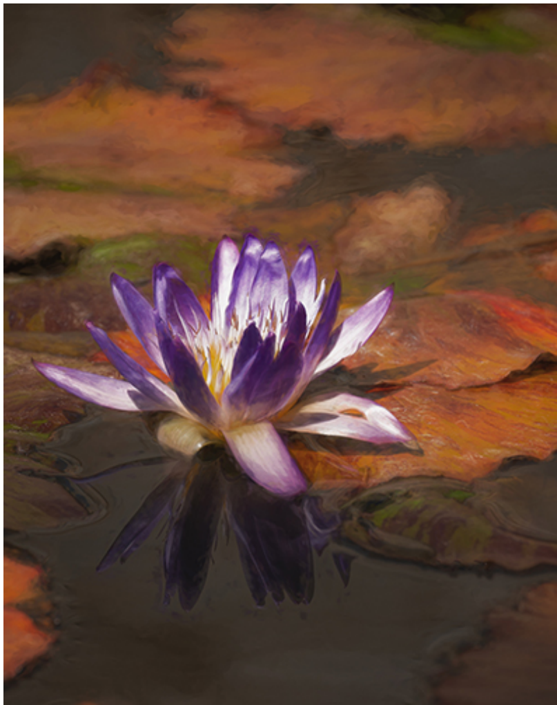
"Monet's Muse" photography, various sizes

As I learned about the exposure triangle and precisely what an f-stop was, I joined several local Meetup groups to practice shooting various subjects. I shot everything from street photography to portraits and nature. I quickly learned that nature was my photographic passion.