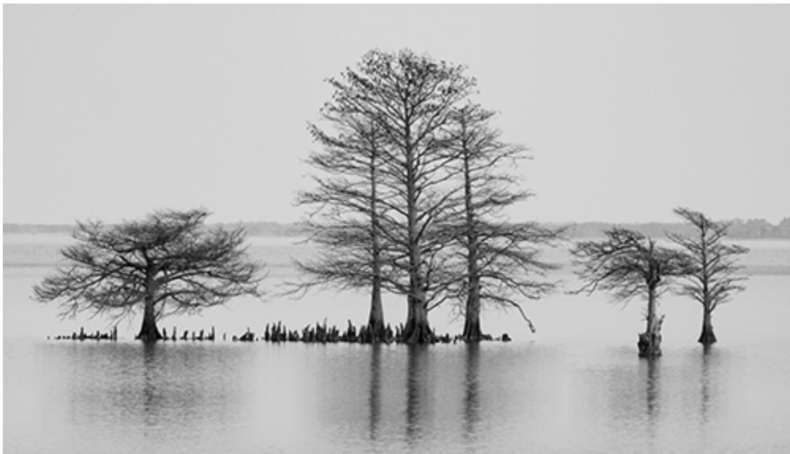
"Bald Cypress Sextet" photography, various sizes

As my skills grew, I became interested in creating more abstract work with my camera and multiple exposures and using textures and other digital tools for more creative expression and interpretation of what I saw and felt in the field.