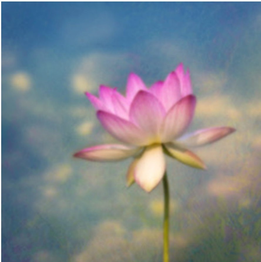
"Lotus Rising" photography, various sizes

I love photographing out in nature and sharing the emotions I feel through my photography and digital artistry skills. My followers and art buyers enjoy living vicariously through my camera lens. My initial focus was on florals shot with a shallow depth of field to create a dreamy blur. I also began to explore landscape photography through workshops and independent travel experiences.