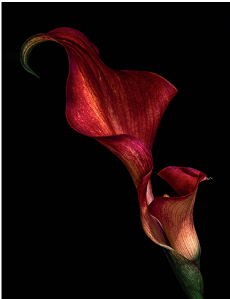
"Calla Ablaze" photography, various sizes

I quickly expanded to include fine art prints and began to share more scenic landscapes and even a few birds in my portfolio.