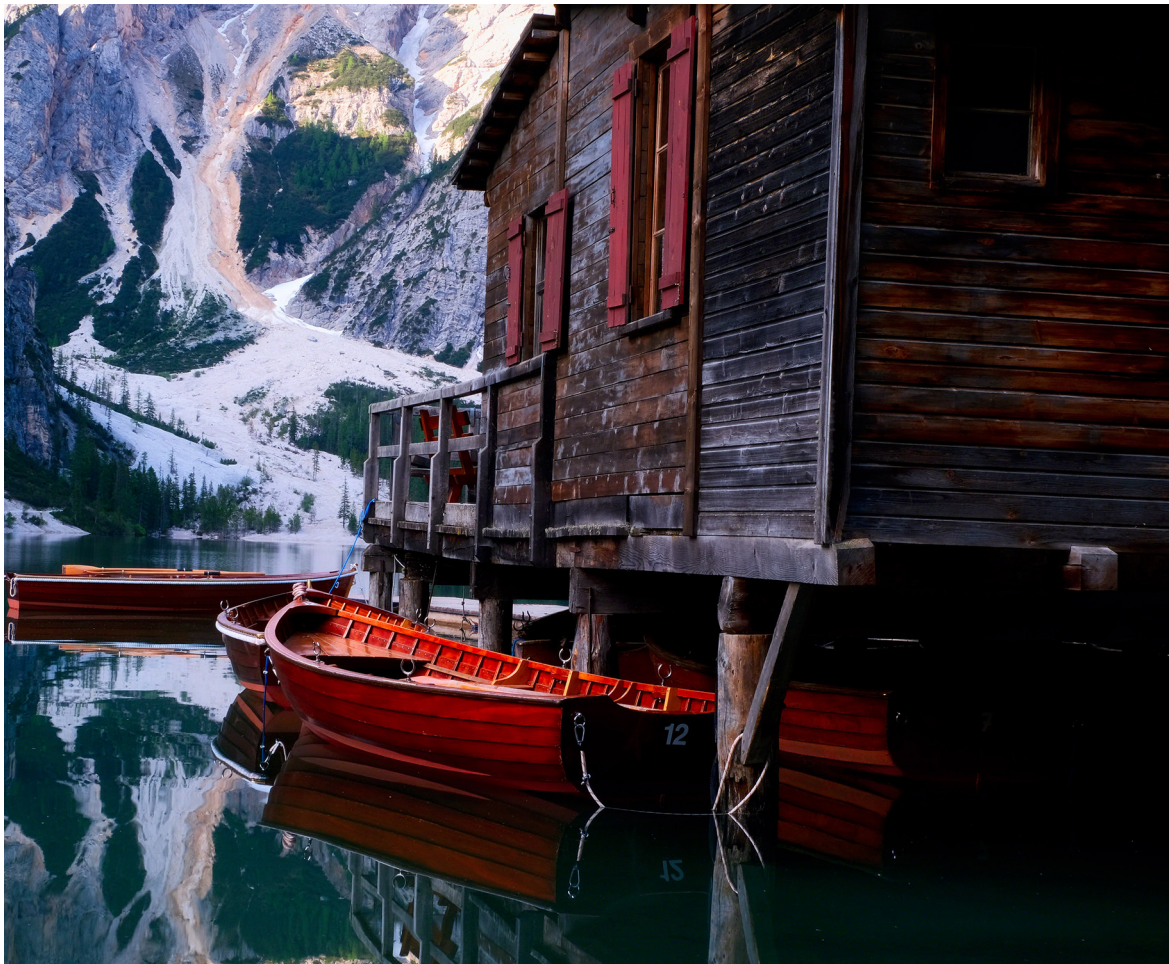
Tethered | Photograph

ing thrills of athletics. She eventually became a gifted horseback rider and figure skater.