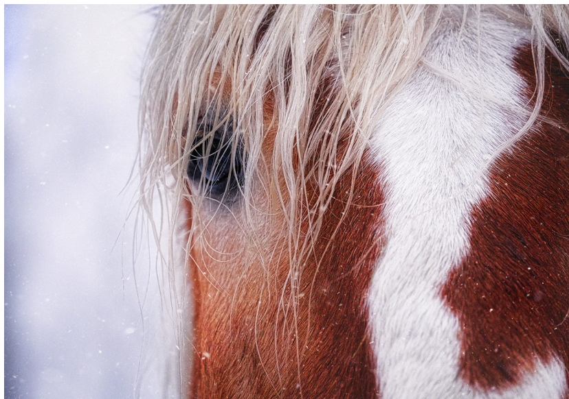
ICU | Photograph