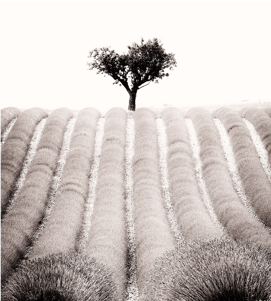
Singularity | Photograph