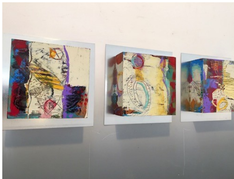
"three pages" acrylic and wood, 8" x 8" each

I am finding my way with gallery space changes and holding classes at the studio. I'm working on acquiring the skills to share myself virtually as well.