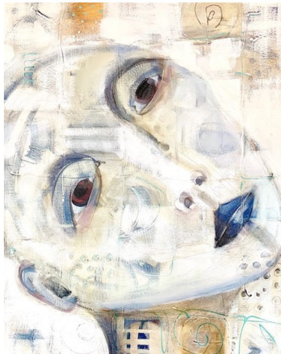
"La Luna" acrylic on canvas, 30" x 60"

When I was seven, I painted goose egg shells tied with ribbon and took them door to door at Easter. I wanted to buy fabric to sew my own clothes and figured this way I could make what I wanted. I agreed to teach pottery to my fellow students if my high school art teacher would allow me to acquire a wheel, kiln and clay as I was bored with drawing and calligraphy (her favorite). The football team and I became art friends.