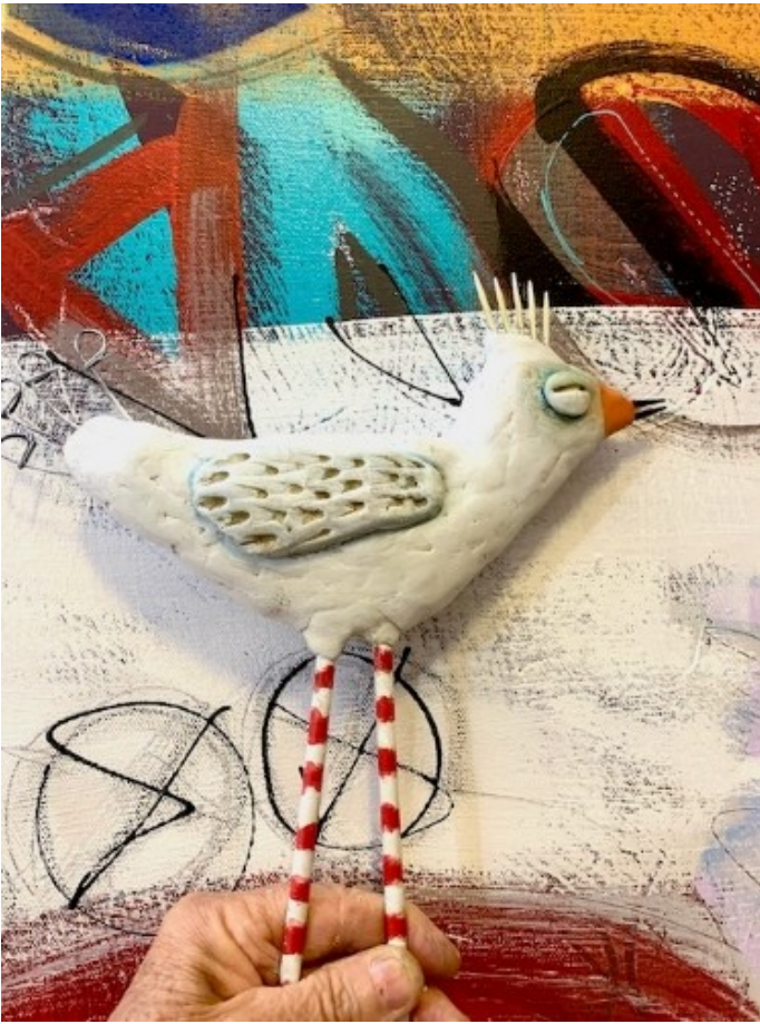
"roadrunner" mixed media, 10" x 9"