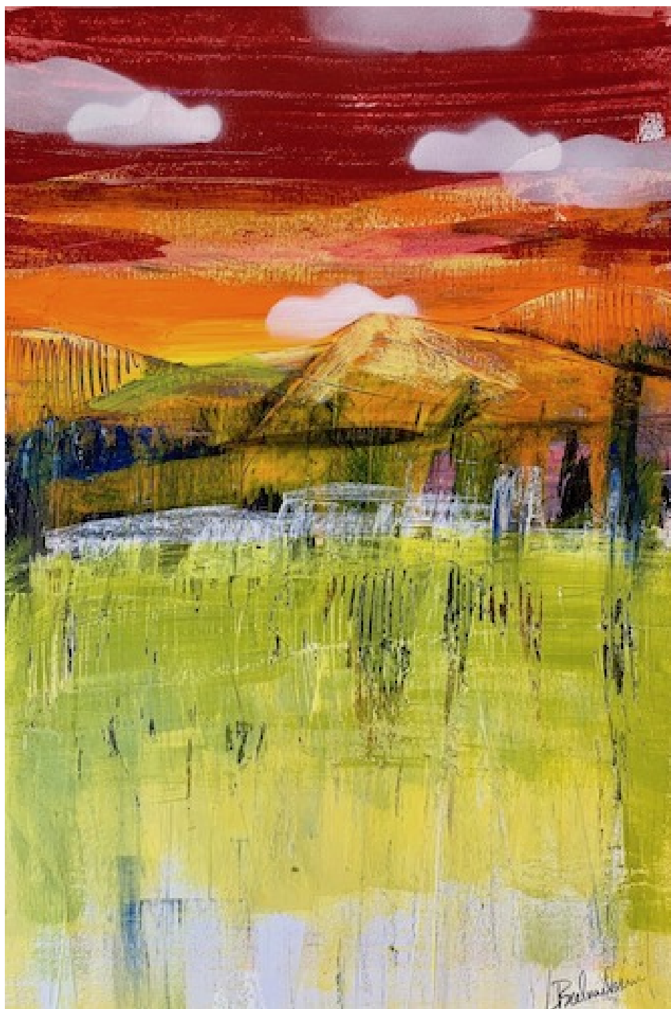
"Red Sky" mixed media on paper, 18" x 24"

It would be rewarding to think that I can relax a bit and just create art that is both meaningful and pays the bills. But I believe that an artist's new reality is such that more than ever we must be proactive in promoting work, teaching, sharing, making videos and so forth. It's an endless job, especially for a single woman with a son who still needs home care.