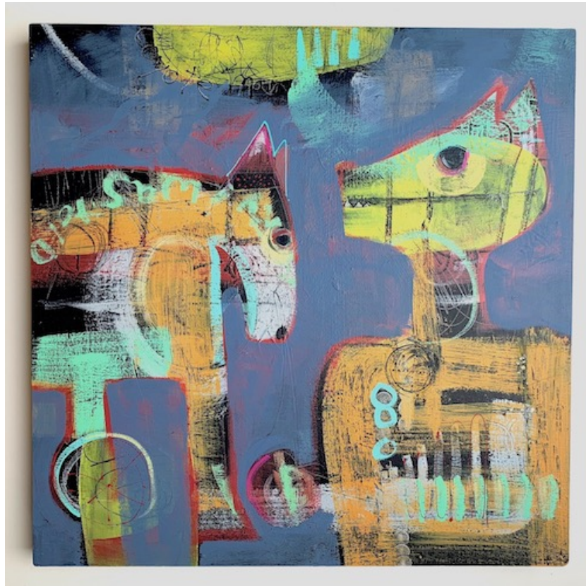
"Petroglyph" acrylic on wood, 24" x 24"

I am finding my way with gallery space changes and holding classes at the studio. I'm working on acquiring the skills to share myself virtually as well.