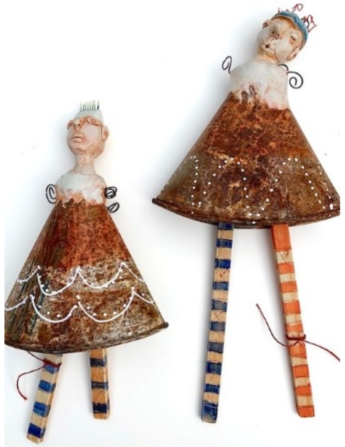
"Can Can" mixed media sculptures, 7" x 12"

Even now as I am painting or working on mixed media sculpture, I continue to seek out other materials just to keep the exploration part of creativity alive and healthy.