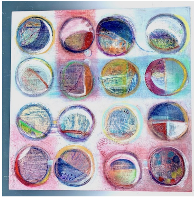
"Names of the Moon" cold wax and oils on wood, 24" x 24"

When I was seven, I painted goose egg shells tied with ribbon and took them door to door at Easter. I wanted to buy fabric to sew my own clothes and figured this way I could make what I wanted. I agreed to teach pottery to my fellow students if my high school art teacher would allow me to acquire a wheel, kiln and clay as I was bored with drawing and calligraphy (her favorite). The football team and I became art friends.