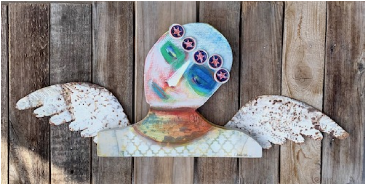
"angel" mixed media sculpture mounted on wood, 30" x 24"

That rule of "body of work" does not seem to apply to all of us. Exhibitions call for one type of work, while the work we produce for the market is another. Sometimes it's as if we are two artists trying to meld into one.