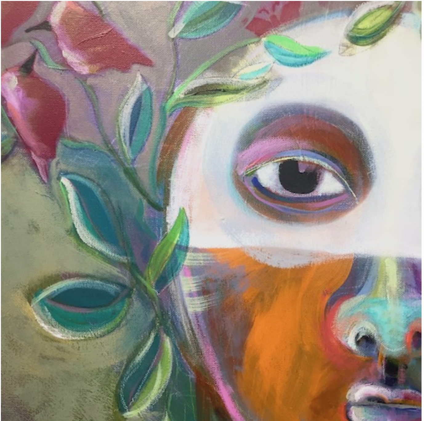
"Red Bird" (detail) acrylic on canvas, 30" x 36"