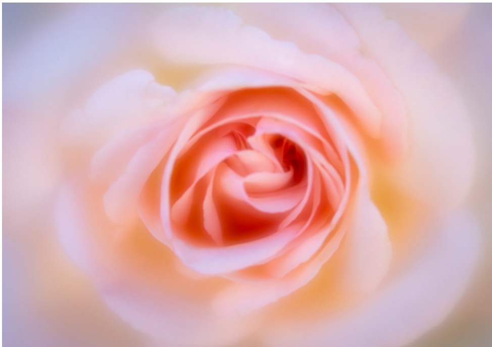
"Blushing Rose" photography, various sizes

I began to actually learn photography following a career-ending medical emergency. My occupational therapist recommended that I write, so I started a blog. Of course, every blog must have photos, so I bought my first DSLR camera.