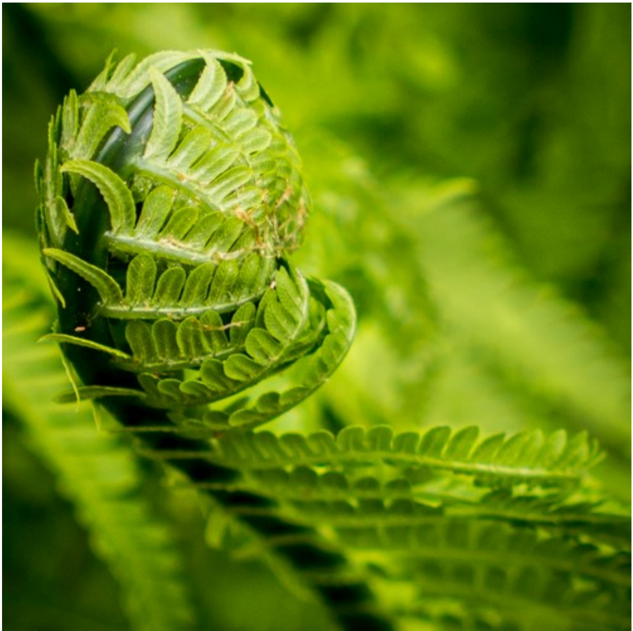
"Fern Unfurling" photography, various sizes

The 2023 calendar will showcase "Messages of Light from the World." Each year's calendar honors health professionals who are working on the front lines of health care and educating the next generation of health practitioners around the globe.