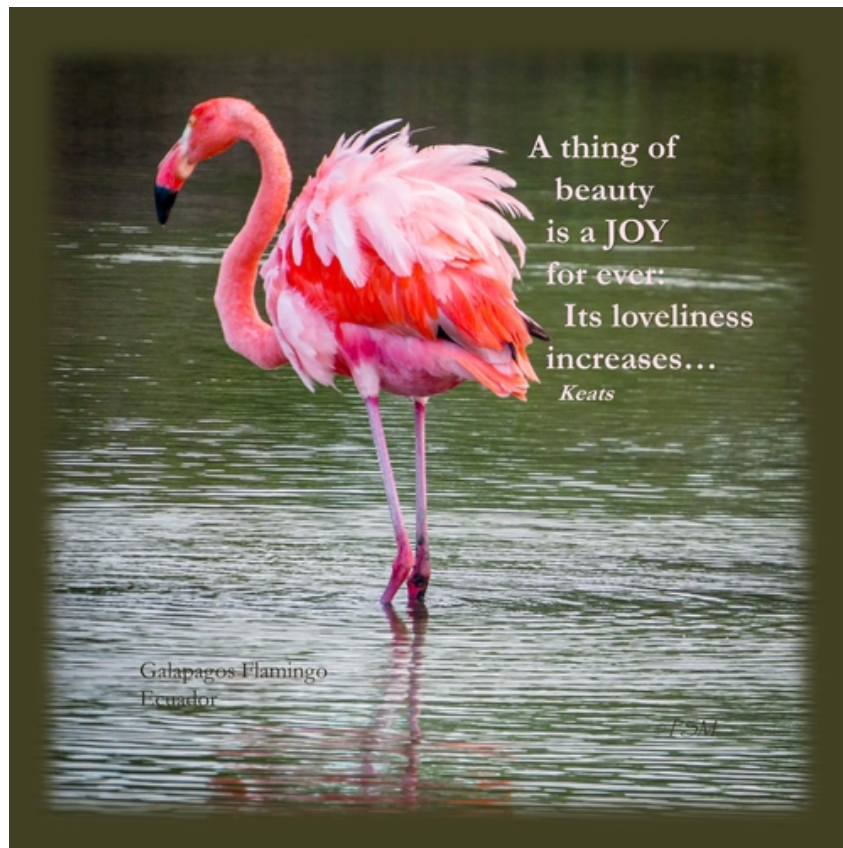
"Galapagos and Joy" photography, various sizes

Both programs dramatically increased my love and understanding of our interconnected world. Most of my travel to six continents has been for regional FAIMER programs in Brazil, Sub-Saharan Africa, India and China. To bring the world closer, I often create inspirational images, combining them with quotes. I have created a calendar for FAIMER for more than a decade. The 2022 calendar showcases "Messages of Joy from the World."