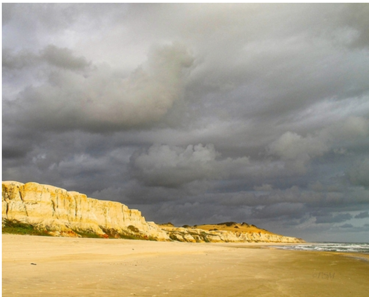
"Dramatic Storm Clouds Over Brazilian Shore" photography, various sizes

Photographer Page Morahan focuses her creative work on a global mission to support non-profit programs. Visit her website to learn more.