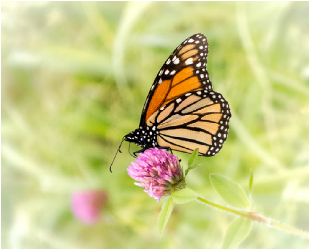
"Monarch Feasting On Clover" photography, various sizes

I prefer to stay as close to the original view as possible, though sometimes it's amazing what software can do to better evoke the mood I try to portray! I currently use a mirrorless Olympus for its small size and weight, and do modest editing in Lightroom.