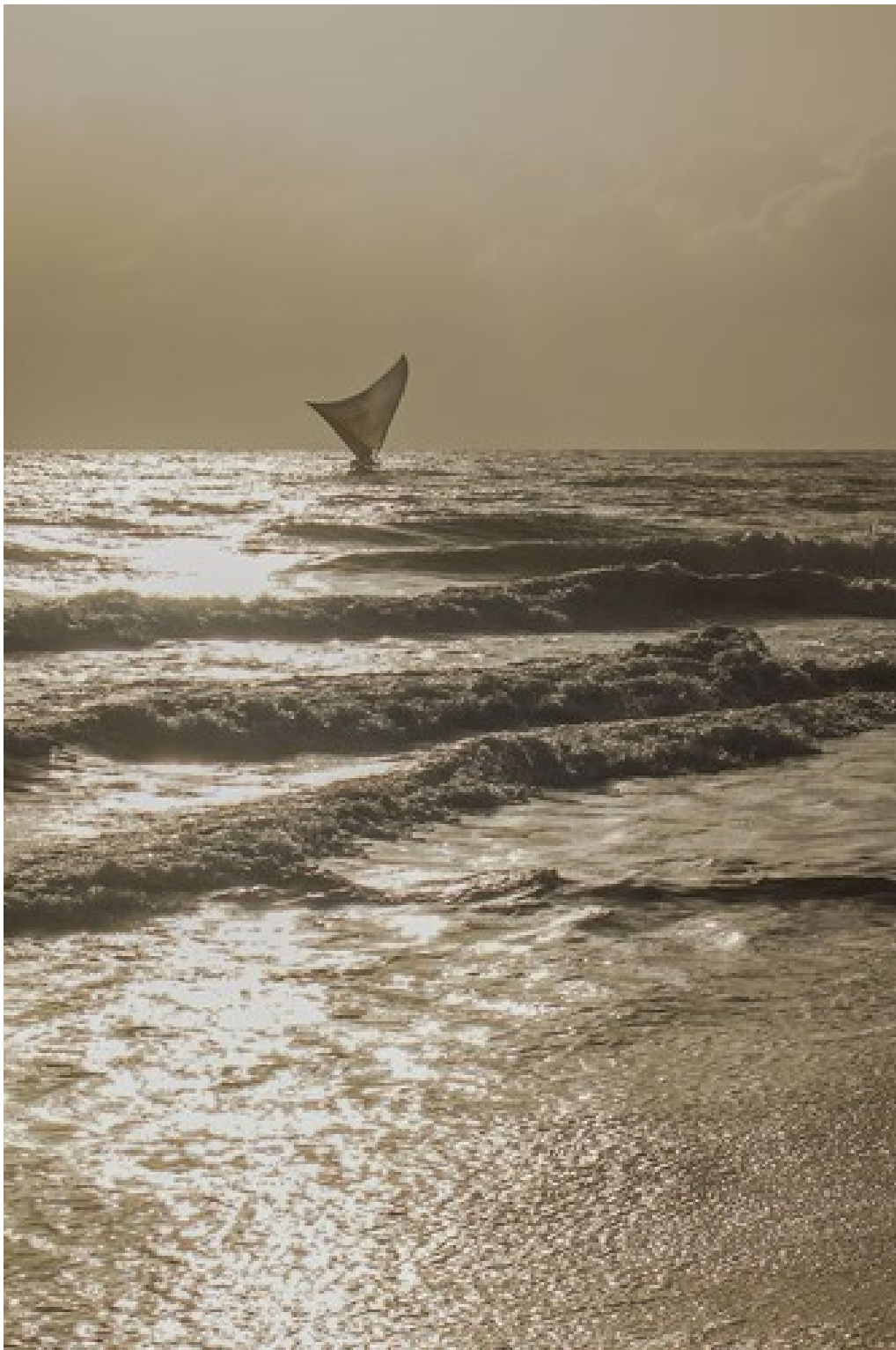
"Dawn Light" photography, various sizes

I have won awards in the annual Pennypack Photo Contest. My photographs are available for sale in various media and sizes on my online gallery, as are calendars, greeting cards and gifts.