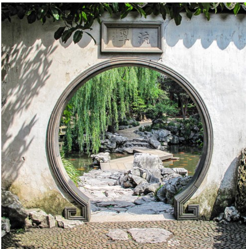
"China Gate" photography, various sizes

An aspect of my global mission is to support the work of the not-for-profit, Foundation for the Advancement of International Medical Education and Research (FAIMER). I had the honor of founding the ELAM leadership program for mid-career women faculty and co-founding the International FAIMER Institute for mid-career health professions faculty around the world.