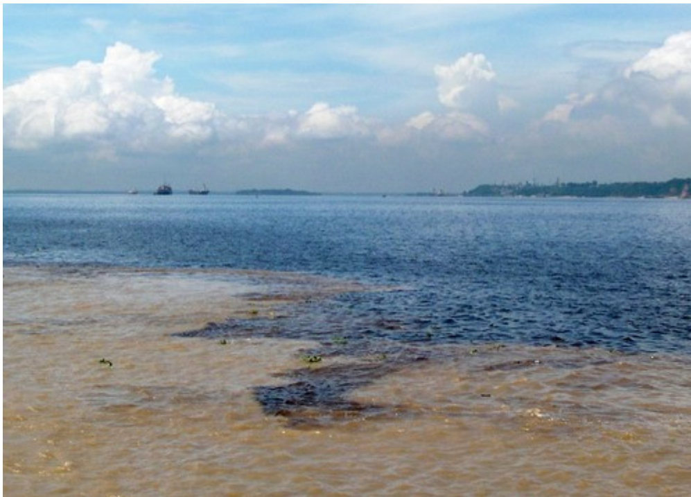
"Joining Rivers To Create Amazon" photography, various sizes

An aspect of my global mission is to support the work of the not-for-profit, Foundation for the Advancement of International Medical Education and Research (FAIMER). I had the honor of founding the ELAM leadership program for mid-career women faculty and co-founding the International FAIMER Institute for mid-career health professions faculty around the world.