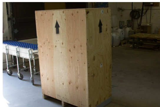
Closed and Ready to Go—Destined for Los Angeles and a ship bound for Hawaii