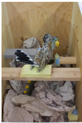
Finishing the Crating