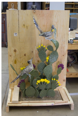
Beginning the Crating Process

Following the show, this first piece was promptly photographed, crated and shipped off to Hawaii!