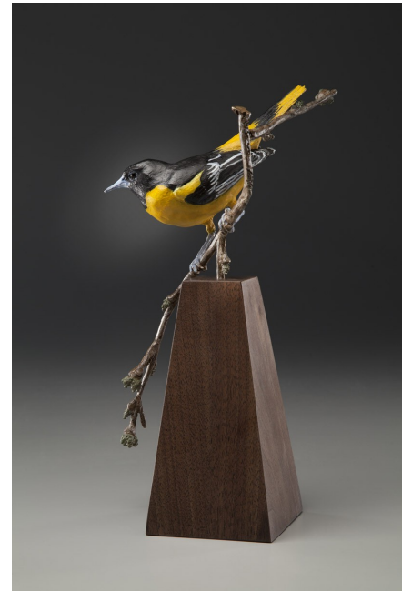
"Sunshine and Shadow" -