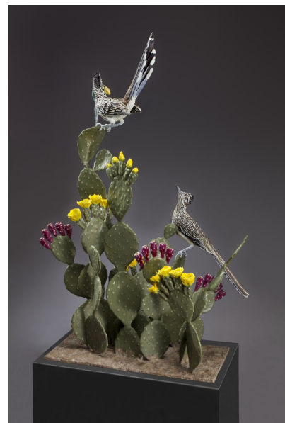
"Eyes On The Prize" - Greater Roadrunners, Collared Lizard, on Prickly Pear Cactus