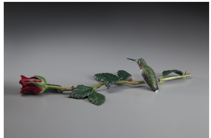
"Long-stemmed Jewel" - Hummingbird on Long-stemmed Rose

(For those sweethearts out there, this piece is also available as a single long-stemmed rose, minus the hummingbird.)