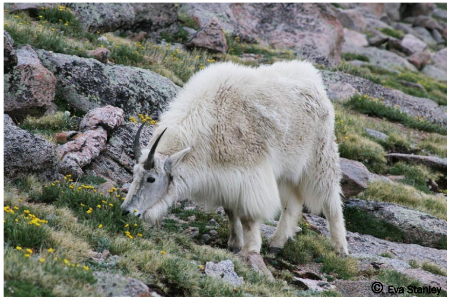
Mountain Goat, Mt. Evans, Colorado

** (Sorry, that upper photo looks way too happy, given the state of Colorado at the moment. But I will leave it there because hopefully it says something about indomitable spirits and the human ability to rebound despite our difficulties. The extensive flooding and highway loss (17 miles of Hwy 34 alone!) has destroyed human access into most areas—mountains and high plains. For the first time in almost 100 years, Colorado's wild ungulate (hooved) population will enjoy a very peaceful breeding season this year, without all that human presence! They are certainly much more resilient in the face of Nature's antics than we are! I wonder if the migratory birds may be forced to move straight on through this year because of food issues? Just looked, and Rocky Mountain National Park is CLOSED, except for Trail Ridge Road, which is only open to essential traffic (ie, Estes Park residents having to get in and out for services through Grand Lake on the western side. Who knows what they will do come winter! They will have to find some of that pioneer spirit to see them through, or leave before winter sets in. That is for sure.) Hopefully, today will be our last rain for a while! For more Park info: www.nps.gov/romo/planyourvisit/flood_alert.htm