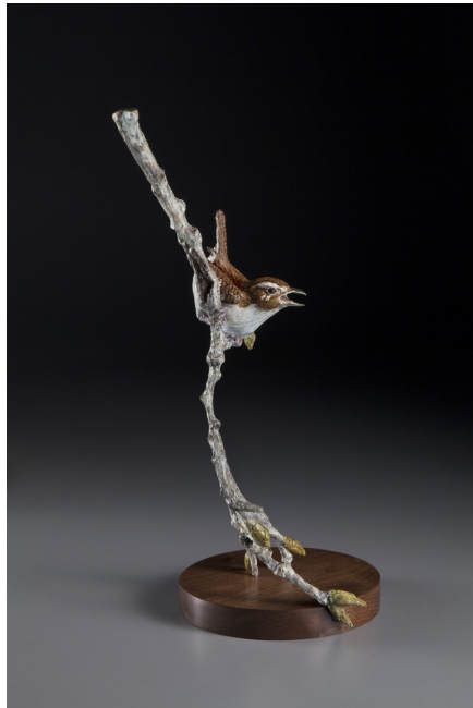
"Bright Note" -

My second choice for the " Heralding Spring " collection is " Sunshine and Shadow " - a life size male Baltimore Oriole, in all his breeding splendor, caught in a split second of time as he momentarily perches on a budding White Oak branch, while searching the woodlands for his heart's desire.