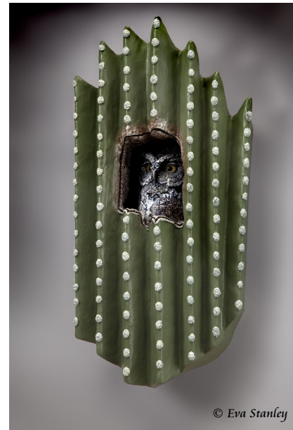
"Desert Denizen" - Western Screech Owl in Saguaro Cactus Ltd. Ed. 25

Hopefully not much still left in there, but the Roadrunner molds and alligator crate. Hold a good thought that the water has not risen that high!