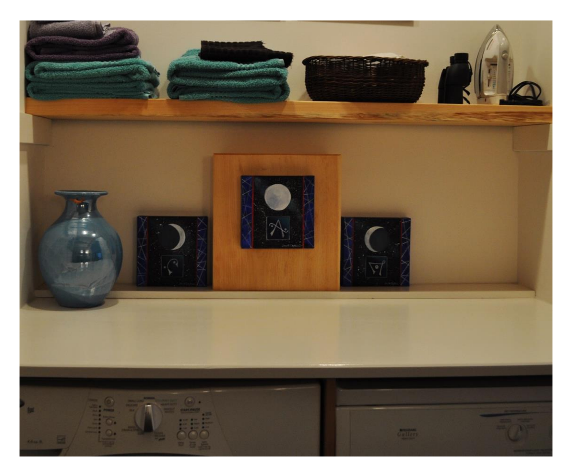
A Few more Tips for Hanging Art

Hanging paintings that go together in an unusual space makes a practical area of your home into a special place to work. These paintings are part of my laundry room and make even folding clothes feel like an art.