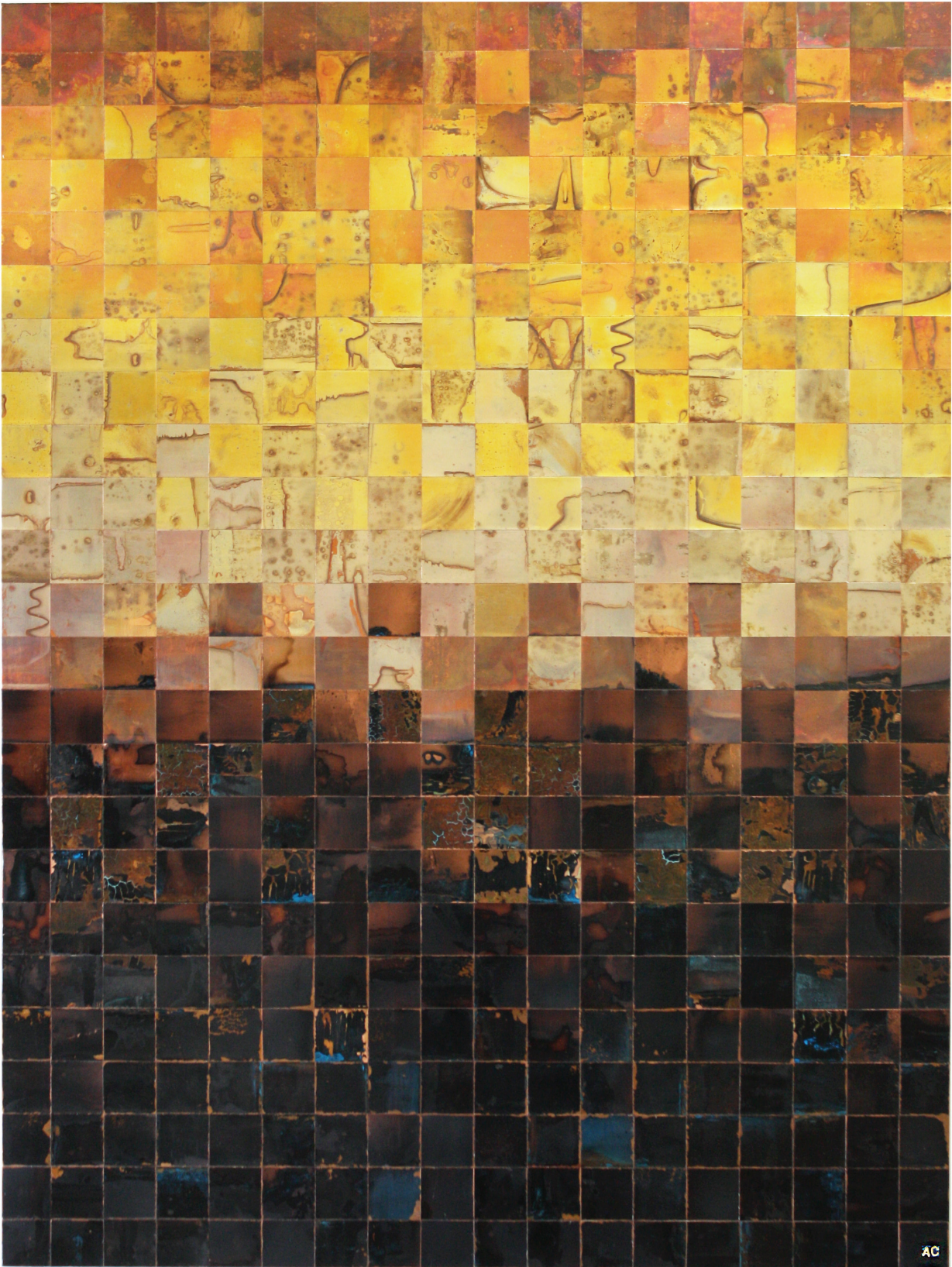
Everything, All At Once