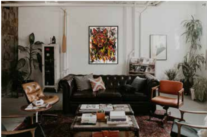
A WOLF IN CHIEFS CLOTHING ORIGINAL || $8500 prints starting at $30

Nothing makes a statement like an original painting. Originals include custom framing, and local delivery or nationwide shipping.