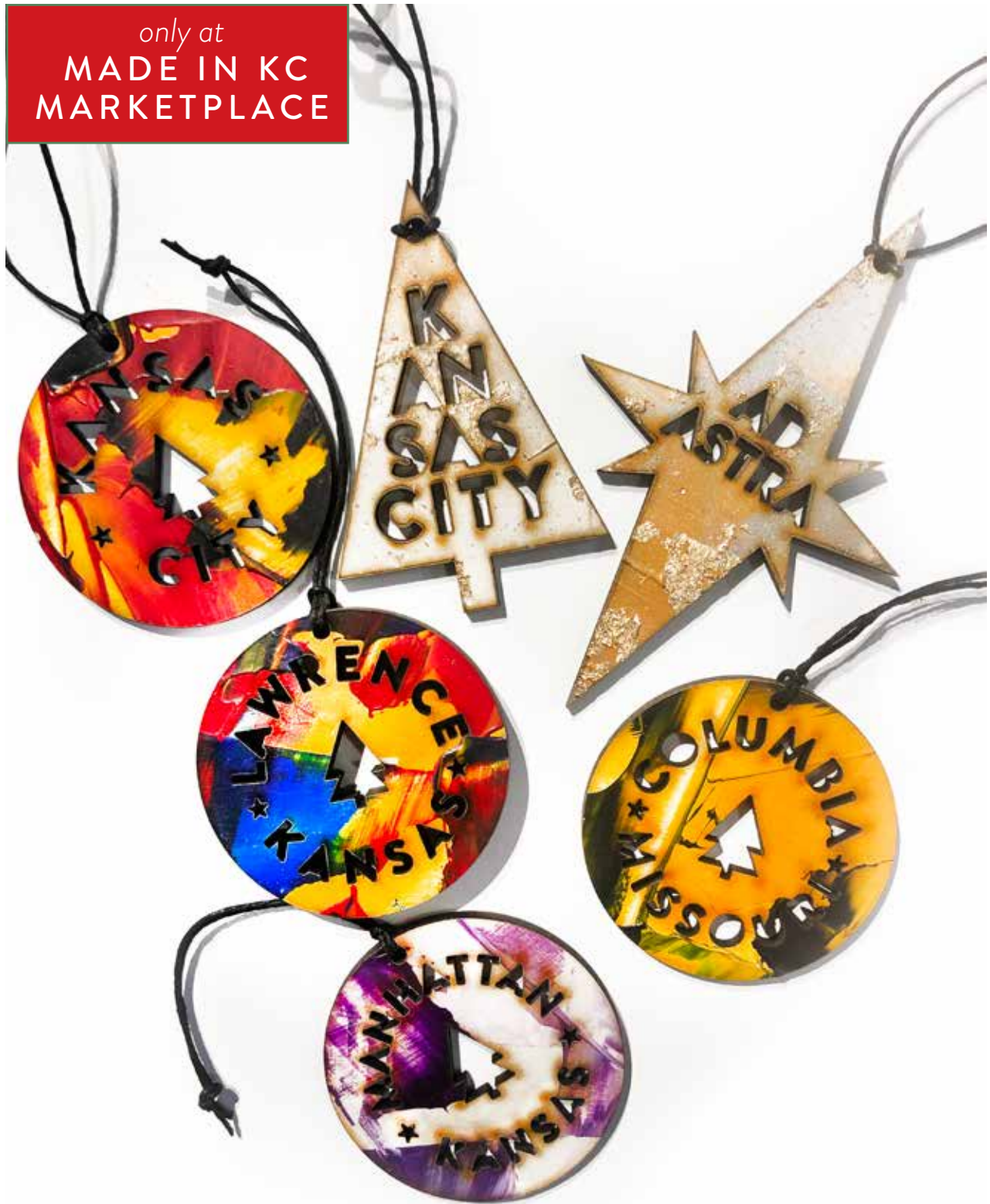
ASSORTED ORNAMENTS (clockwise from top left) KC CHIEFS, KANSAS CITY TREE, AD ASTRA (part of the Kansas state motto, meaning “to the stars”), MIZZOU, KSTATE AND KU. || ALL ORNAMENTS $11.95