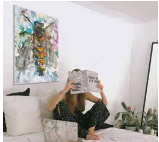
QUEEN A ORIGINAL || $6500 prints starting at $30

SHOP AT MEGHMAKESART.COM // ORDER BY DEC 10 TO RECEIVE FOR XMAS