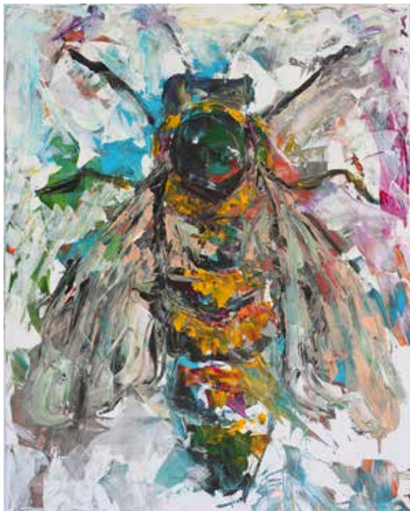
QUEEN A || $6500 30in W x 40in H || Acrylic on canvas

Inspired by the difference between the top and bottom sides of native butterfly species, and my pollinator garden.