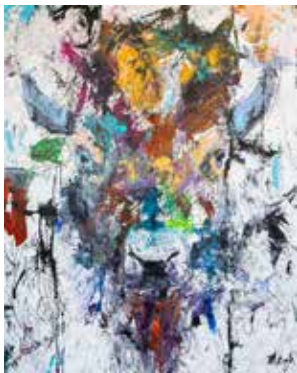
MR BISON, INK Original available || $9500