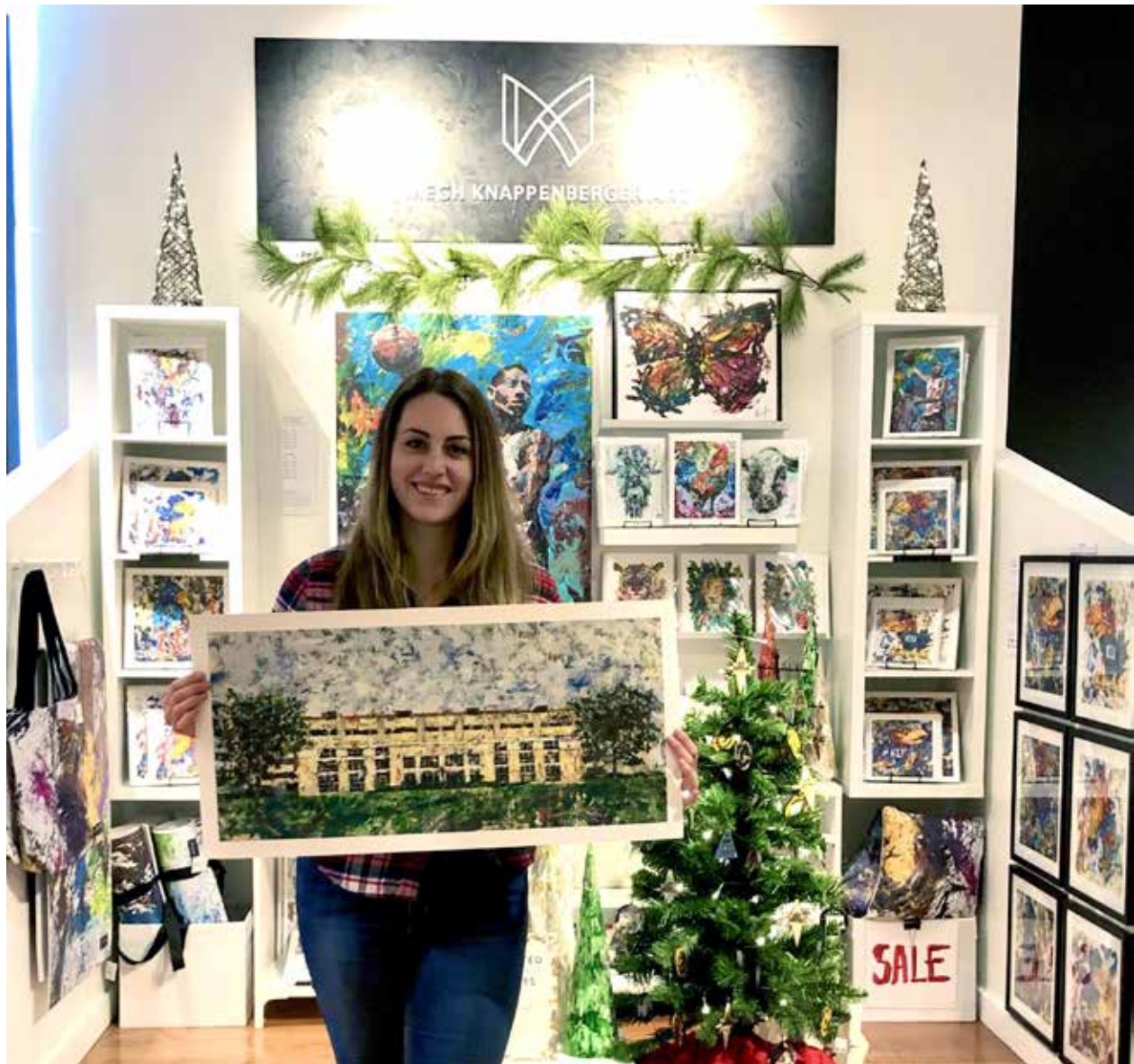
THE FIELDHOUSE || (pictured: 28x14 paper print, $195)