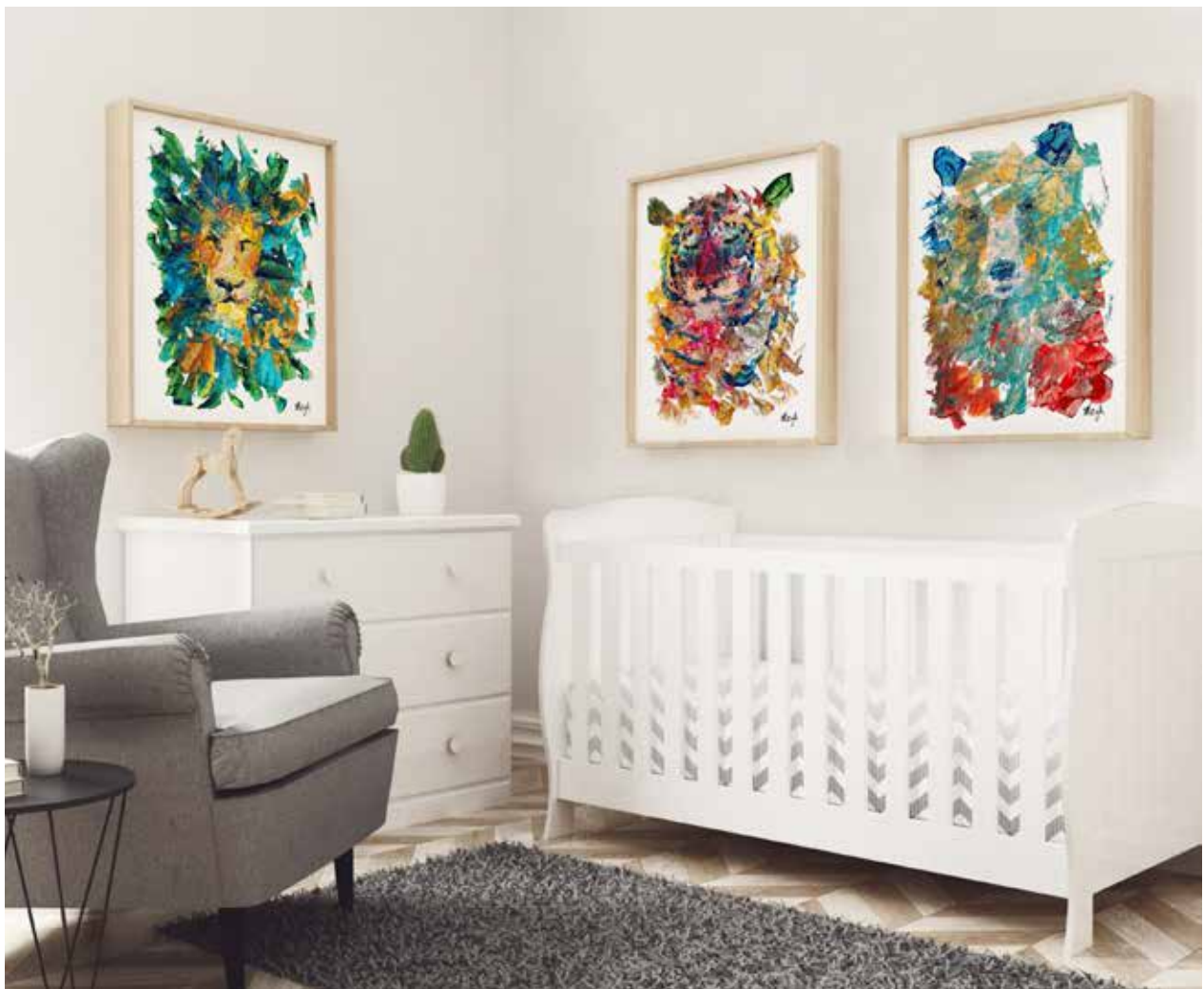
(from left) LION 2, TIGER 1, BEAR 1 || PRINTS STARTING AT $30

Visit www.meghmakesart.com/lions-tigers-bears to see all the different lions, tigers and bears.