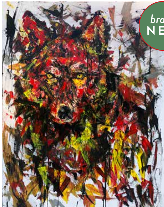
A WOLF IN CHIEFS CLOTHING || $8500 30in W x 40in H || Acrylic, ink and charcoal on canvas

A celebration of the queen bee, and the fascinating little democracy of the beehive.