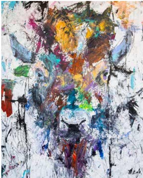
MR BISON, INK || $9500 4ft W x 6ft H || Acrylic, ink and charcoal on canvas

From my large bison head series, inspired by a trip to the Maxwell Wildlife Refuge. Wild for the bison's wildness.