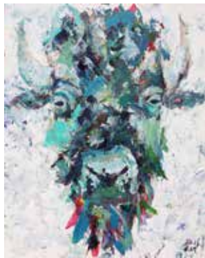
MR BISON, MEMPHIS