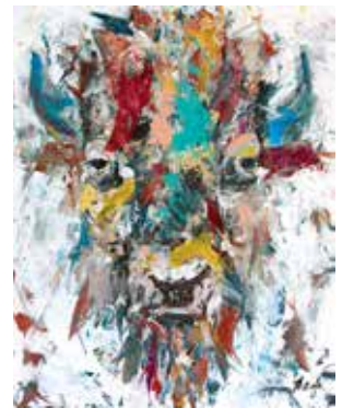
MR BISON, WARM

Bison prints start at $30 Available Chipboard Series originals are $695, and include framing. 16in x 20in.