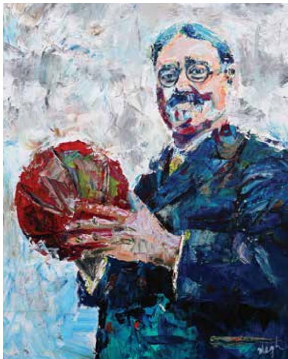
DR NAISMITH || Starting at $30 A portrait in crimson and blue of KU's first coach and the inventor of basketball himself.