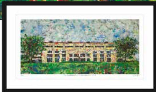
PLAZA EDITION 2019 (right) || $395 / $595 A hand-signed and numbered limited edition print, framed or unframed. Only available online until Dec 1! Order yours today.