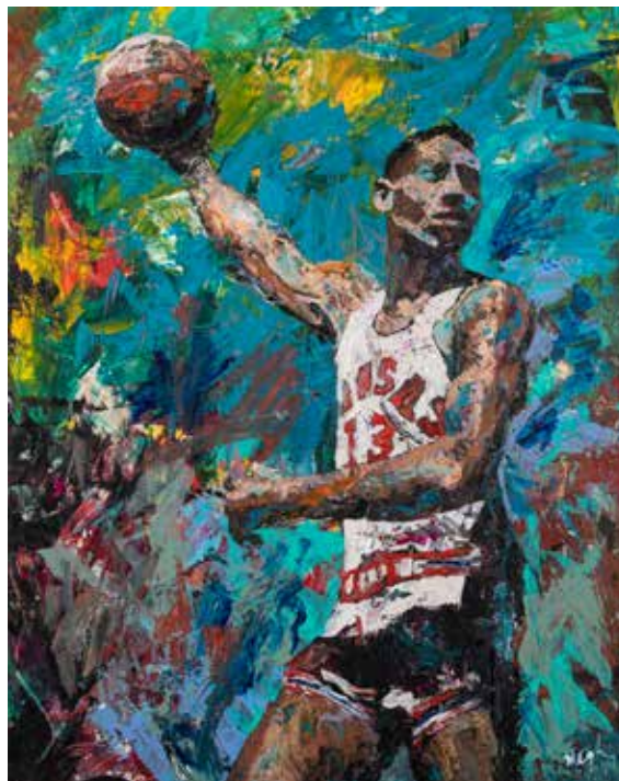
WILT || Starting at $30 The man, the myth, the legend – a portrait of Wilt Chamberlain in his original KU duds.