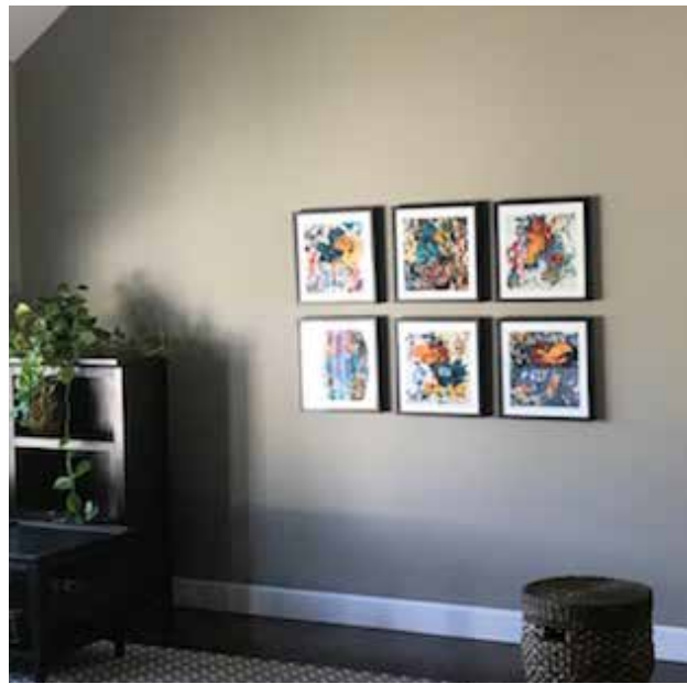
PHOTOS FROM COLLECTORS' HOMES! LIMITED EDITION JAYHAWK SETS || $1500

SHOP AT MEGHMAKESART.COM // ORDER BY DEC 10 TO RECEIVE FOR XMAS