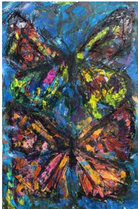
BUTTERFLY DUO || $7500 3.5ft W x 5ft H || Acrylic, ink and charcoal on canvas

From my large bison head series, inspired by a trip to the Maxwell Wildlife Refuge. Wild for the bison's wildness.