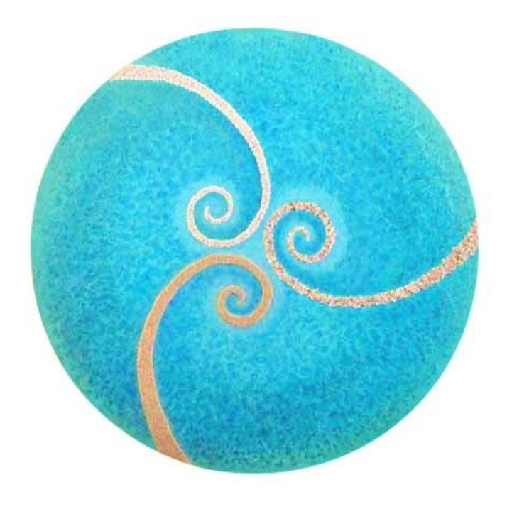
N A V A R A T R I Sand, shells, peacock feather, bindis and rhinestones from India with metallic acrylic + oil paints on canvas